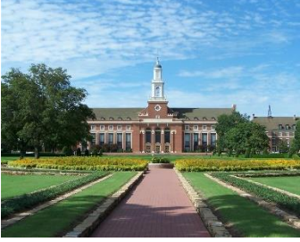
Edmon Low Library

Background buildings are designed to enhance the harmony of the campus landscape and blend in with the campus fabric. While they should be of high quality in their design, aesthetics, and construction, they do not draw undue attention to themselves and avoid showiness or ostentation. Background buildings should not be taller at their highest point (excluding chimneys) than the roof peak of the Edmon Low Library. Most buildings on campus, including those that house the colleges, are background buildings.