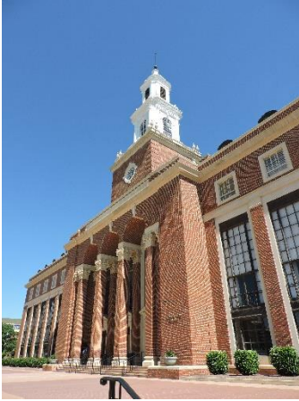
Edmon Low Library